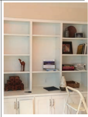
GET RID OF A SHELF IF THEY ARE ADJUSTABLE!

The covers of picture books can be too lovely to wither away shoved deep in a bookcase. Display them, propped up in the backs of cabinets, to show off the book and to add color and interest.