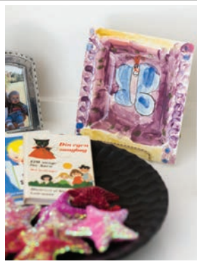
USE YOUR KIDS' ART!

Using kids' art in small doses personalizes bookshelves and adds color and meaning.